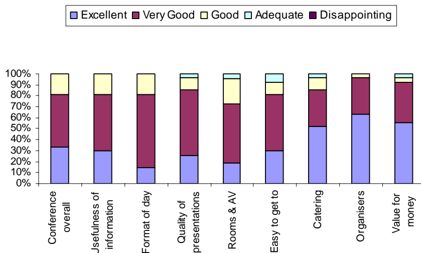
Figure 1 Participants' ratings of the 2006 VSCN Annual Conference