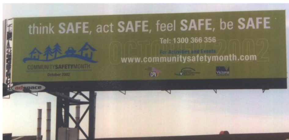
Outdoor roadside sign promoting CSM 2002 (16m x 4 m)

The initial theme for CSW was “think SAFE, act SAFE, feel SAFE, be SAFE” which was then, and remains today, the motto for the VSCN.