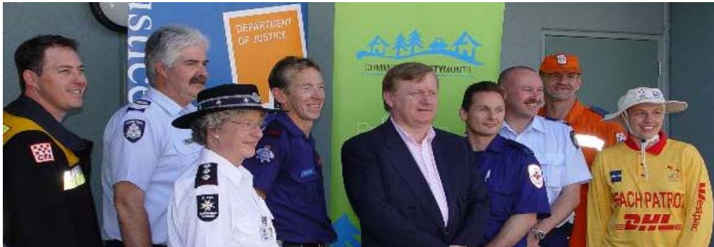
Minister Andre Haermeyer at the Emergency Service Week 2004 Launch with emergency services personnel